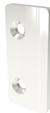
INOX COUNTER PLATE P2045KRV