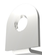
INOX BRACKETS P2050

DIMENSIONS IN [mm] - THE MANUFACTURER RESERVES THE RIGHT TO MAKE TECHNICAL CHANGES WITHOUT NOTICE