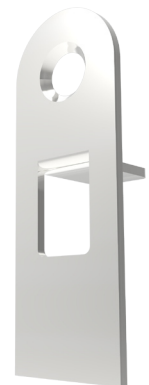
INOX END CAPS P1645

DIMENSIONS IN [mm] - THE MANUFACTURER RESERVES THE RIGHT TO MAKE TECHNICAL CHANGES WITHOUT NOTICE