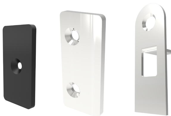
PLASTIC COUNTER PLATE P1830